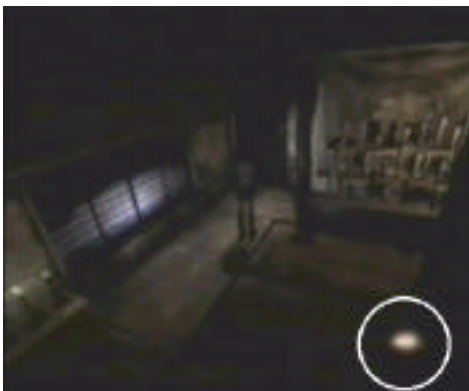
Figure 4: At the lower right corner of the screen, the filament turns orange as Miku, in the middle of the frame, is about to enter a room in Fatal Frame (Tecmo/Tecmo, 2002).

Fatal Frame also has a visual device to warn. In third-person perspective (Figure 4) or through the viewfinder of Miku's camera (Figure 5), the screen displays a filament at the lower right corner in the former case and in the upper middle in the other.