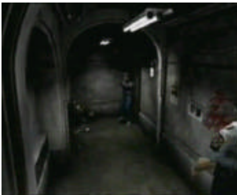
Figure 7: Leon has been waiting long seconds for this first-heard zombie to enter the frame on the right in Resident Evil 2 (Capcom/Capcom, 1998)

Tanya Krzywinska notes that “[m]any video games deploy sound as a key sign of impending danger, designed to agitate a tingling sense in anticipation of the need to act” [16: p. 213]. In that sense, though there is no specific device in Resident Evil , the game warns you in the most classical way by using off-screen sounds (similar to what happens in the underground locations of Silent Hill where the radio doesn't work). The moaning of the zombies and the shuffling of their feet indicate that they are nearby in a room or corridor. In fact, most of the time they are waiting just outside the frame, lurking to jump on you. But sometimes, they are farther away. For instance, if you do not move, it takes more than 15 seconds for the first zombie to enter the frame in a scene on the second floor of the Police Station in Resident Evil 2 (Figure 7), and 5 more seconds for two more zombies to come.