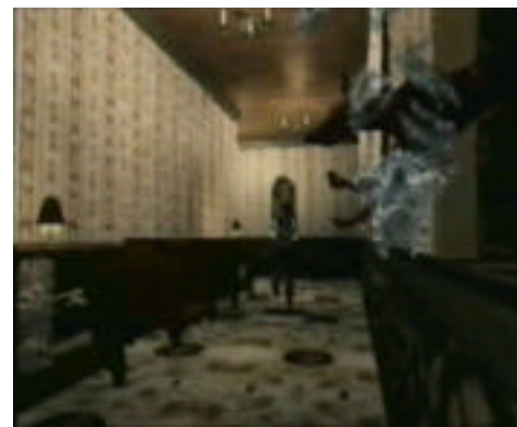
Figure 1: A dog bursting through the right window in Resident Evil (Capcom/Capcom, 1996).

To trigger sudden events is undoubtedly one of the basic techniques used to scare someone. However, because the effect is considered easy to achieve, it is often labeled as a cheap approach and compared with another more valued one: suspense. As in the well-known example of Alfred Hitchcock, a bomb that suddenly explodes under the table where two people are having an innocent conversation will surprise the spectator for only few seconds at the very moment of the explosion. However, if this spectator is made aware that the bomb is going to explode at any minute, he will participate in the scene and feel suspense for the whole time preceding the explosion. “The conclusion is”, Hitchcock says, “that whenever possible the public must be informed” [27: p. 73]. The shock of surprise is consequently taken over by the tension of suspense.