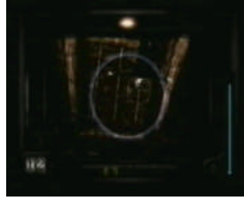
Figure 5: Through the viewfinder, in the upper middle of the screen, the orange filament signals the presence of a spirit, here hanging from the ceiling in Fatal Frame (Tecmo/Tecmo, 2002).

Coupled with heartbeats, eerie sounds and the controller's vibration, the filament turns orange when spirits are nearby (and blue when you are near a clue). This device is more than essential in Fatal Frame as you face incorporeal entities that are otherwise translucent and as you are plunged into darkness with only a