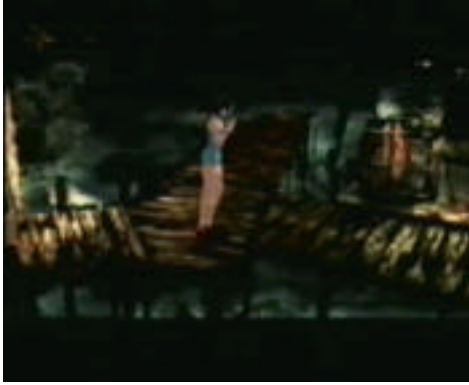
Figure 3: The Fear Meter remains visible for a while in the village of Fear Effect (Kronos Digital Entertainment/Eidos Interactive, 2000)

The Meter remains visible for about two minutes in a search scene in the village, for instance (Figure 3). Although Hana (armed with her pistol as we can see) has faced green zombie-like natives in the left branch, you yet still anticipates more action on the right branch.