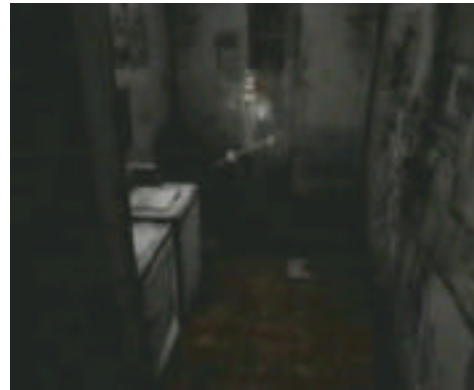
Figure 9: Too scared to get out of the laundry room of the Wood Side Apartments in Silent Hill 2 (Konami/Konami, 2001).

To explain the relation between coping and emotion, Folkman and Lazarus distinguish two general and interrelated coping processes. The first strategies, called emotion-focused coping, are employed to regulate the situation causing distress. As Folkman and Lazarus talk among others about avoidant and vigilant strategies, another way to understand this is to refer to the degree to which individuals will either monitor (seeking information) or blunt (avoiding information) under threat [18]. Dispositional differences show that monitors (Miller is talking about high monitors/low blunners) scan for threat-relevant information and prefer to attend to information signaling the nature and onset of the shock as well as information about their performance when carrying out a task. Contrarily, blunners (i.e. high blunners/low monitors) tend to avoid informational cues and distract themselves from threat-relevant signals. Using this distinction to study the interaction between forewarning and preferred coping style in relation to emotion reactions to a suspenseful movie, Glen G.