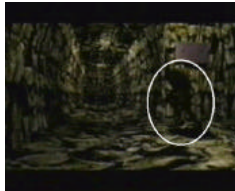
Figure 8: A cutaway to the impending attack of a Hunter in Resident Evil (Capcom/Capcom, 1996).

Other examples of this waiting occur on the first floor when zombies moan in an office you'll have to enter, and later on in the Vacant Factory where Leon and Ada hear an approaching zombie for no less than 40 seconds. Be that as it may, the forewarning does not rely only on this technique. Now and then, the search of a room is accompanied by typical, suspenseful extradiegetic music. Resident Evil also makes use of a few cutaways. Interestingly, it shows the impending attack of a Hunter twice. The first with a cut to an 18-second, fast traveling shot when this monster initially appears, and the second with a cutaway in the underground courtyard path (Figure 8).