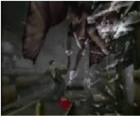
Figure 6: Harry is off to a good start before getting the red pocket radio at the beginning of Silent Hill (Konami/Konami, 1999).

anticipation is actually extended compared to the parts that take place indoors. In the streets, the static fades in when you advance towards an unseen monster and fades out when you change direction to hurry away. It fades in again along with the monster's own noises when you cannot avoid a confrontation. Frequently this can last more than half a minute. You're always kept on your toes. What's more, when the radio begins to transmit noise and you cannot see outside the light beam of your flashlight, fear seizes you rather intensely.